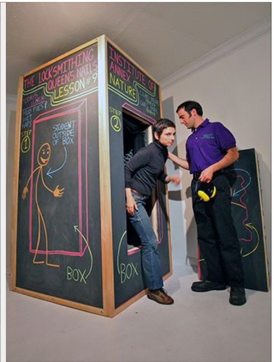
The Locksmithing Institute of Queens Nails Annex, Lesson Plan #9: Nature, 2007, Social Practice and Photo.

In Lesson #9, students were given the opportunity to enter The Locksmithing Institutes mobile chalkboard isolation chamber (a space in which all light and sound have been removed). Each student that wanted to experience the isolation chamber got to spend 5 timed minutes in the box while students outside discussed their experiences with the instructor. The experience was free and open to people of all ages and abilities.